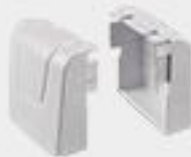
PC End Cap