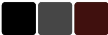
Black Grey Brown